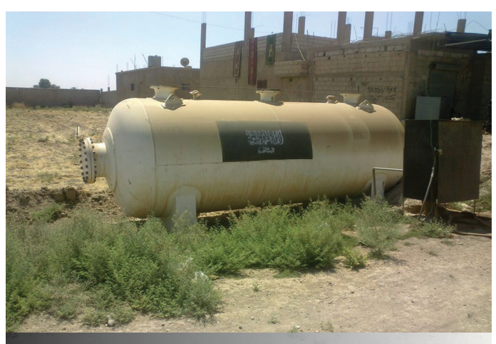
Al Nusra front Gas distribution point in Altayyanah

However, the productivities confirmed, according to the lowest margin of revenue of the wells in the main site for the field, was estimated with 5,000 barrels per day at a minimum, in addition to 7,000 barrels from the vicinity of the site, which were sold for 4000 per barrel (US $ 30-40 at the time). This meant that 360- 480 thousand US dollars a day, was poured into the funding of the factions controlling the field, or into the pockets of its commanders. Added to this figure were the profits of Red gasoline, and quotas of varying size from intermittent partnerships from oil wells that were distributed in different areas. All of which was under the control of the commission, which some former employees insisted that the commission's authority was to be described as a nominal control, purged of any possible affiliations.